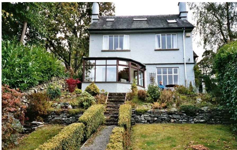
Creative Support's Holiday home Howe Top in the Lake District