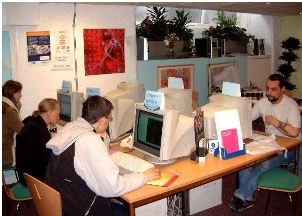
Creative Support's Cyber Café at Dale House

Creative Support is a non-profit making organisation and is registered as an Industrial and Provident Society with Charitable status. The agency was founded in 1991 and now provides a range of high quality person centred services within 53 local authorities. Committed to the principles of the Recovery Model and the Social Inclusion agenda, we have a proven track record of achieving valued outcomes for individuals.